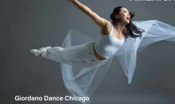
Giordano Dance Chicago