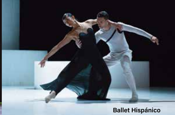
Ballet Hispánico CARMEN.maquia