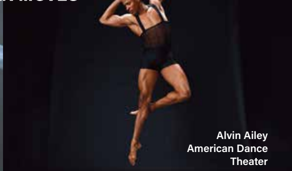
Alvin Ailey American Dance Theater